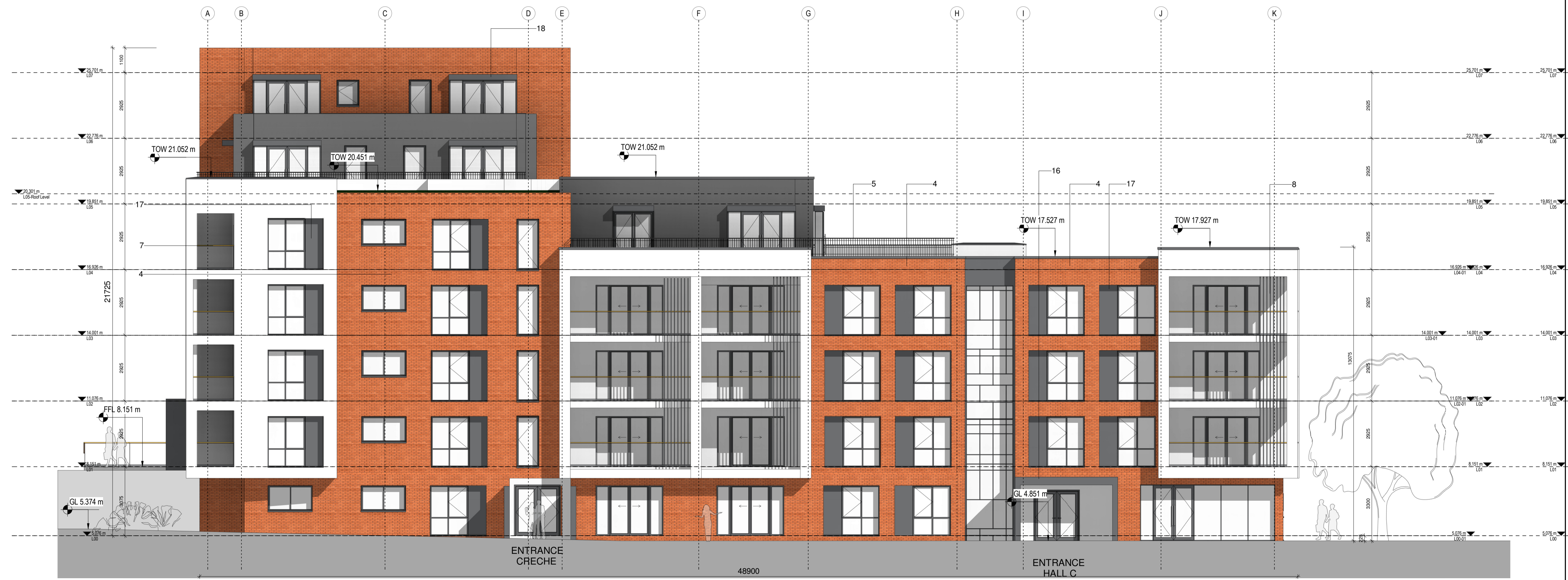
2 ELEVATION.B 1 : 100 @A1

P03.04 13.03.18 | BLR | Issued to Planning Consultant for Review P03.03 02.02.18 | PJK | Issued To Planning Consultant For Review P03.02 25.01.18 | IMG | Issued For Client Review Meeting P03.01 18.08.17 | IMG | Issued for Planning