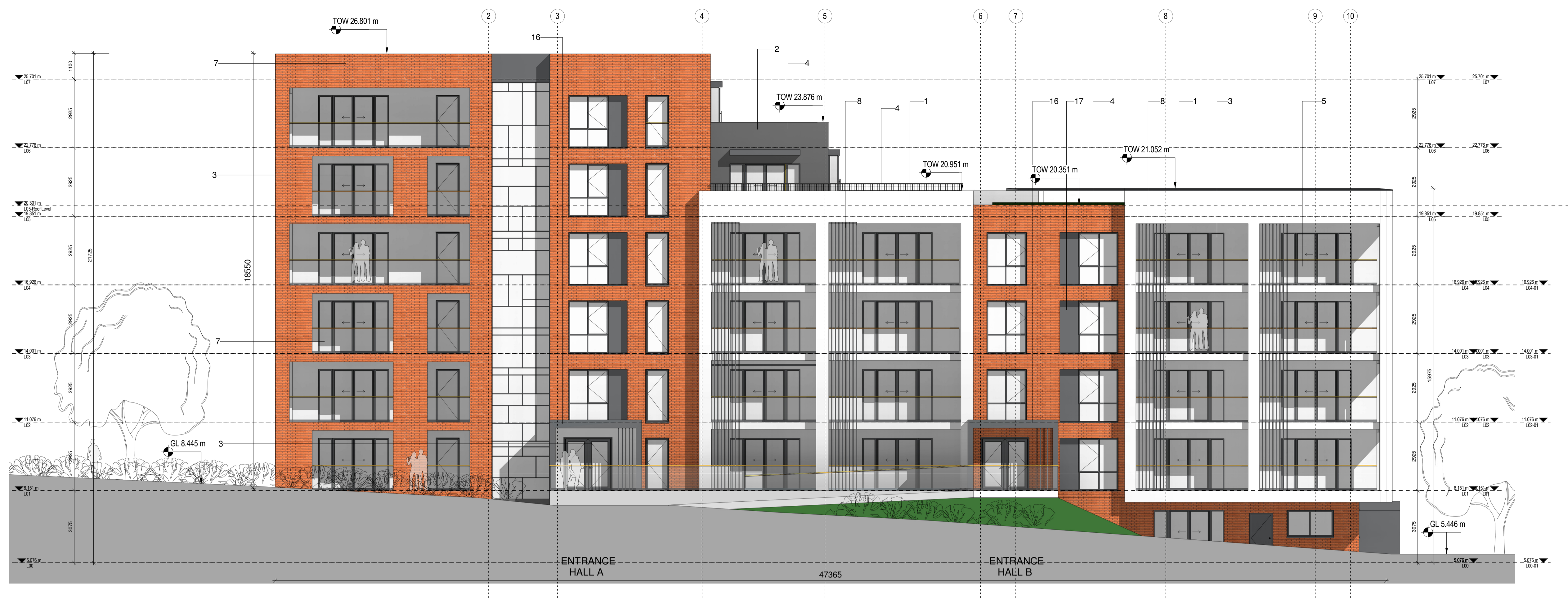
1 ELEVATION.A 1 : 100 @A1